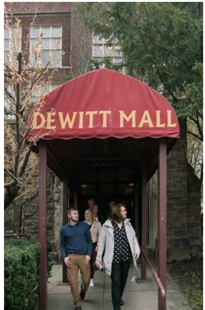
Special thanks to Ithaca is Foodies Culinary Tours

Depending on the scale and nature of your project, you may need to reach out separately to staff in each of these three divisions to help you understand which permits and approvals may be required.