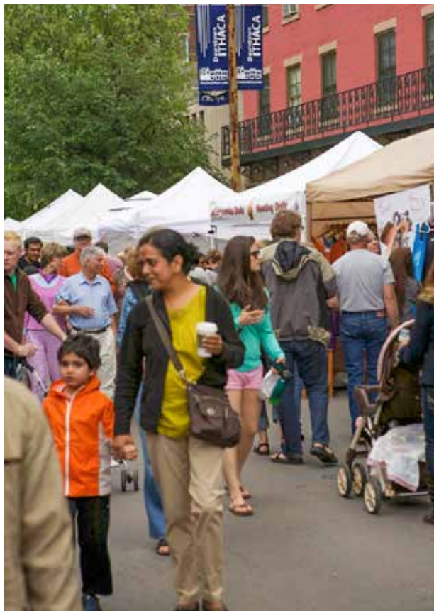
Downtown Ithaca Alliance