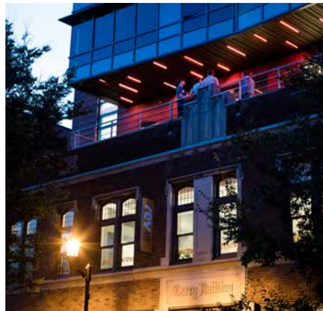
Rev: Ithaca Startup Works

The downtown is the economic, social, and cultural heart of the City and County. This dense, walkable, and growing commercial district includes the Ithaca Commons, a large public pedestrian mall, small-scale retail, numerous restaurants, services, housing, and offices.