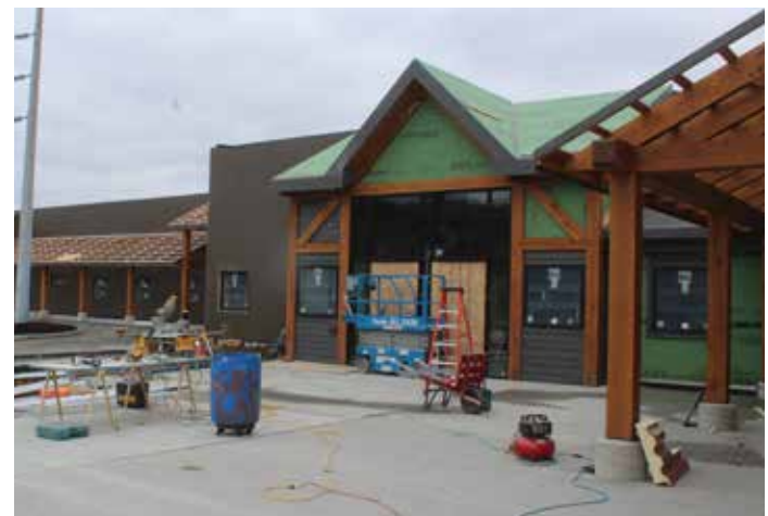
GreenStar Co-Op under construction in the Waterfront District

2 WATERFRONT/INLET ISLAND: This scenic area bordering Cayuga Lake has a broad range of existing business uses: marinas and boathouses, the Ithaca Farmers Market, the Cherry Street industrial area, light manufacturing, and pockets of retail and services. Several large mixed-use development projects hosting housing and medical uses are proposed for the area.